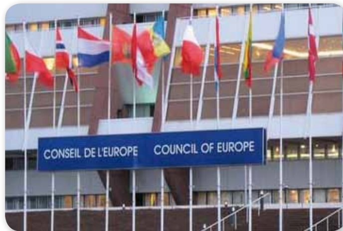
Council of Europe, Strasbourg

The project “Network for Community Development with Marginalised Social Groups”, part of the LIFELONG LEARNING PROGRAMME - GRUNDTVIG – Learning Partnership, aims to facilitate the mutual learning of innovative tools of community development that tackle the problems of marginalized social groups in different regions of Europe. The main aim of the project will be sharing knowledge and experiences of the partner organisations gained from experimental, innovative, interdisciplinary community based methods effective in combating poverty that can be adopted in other