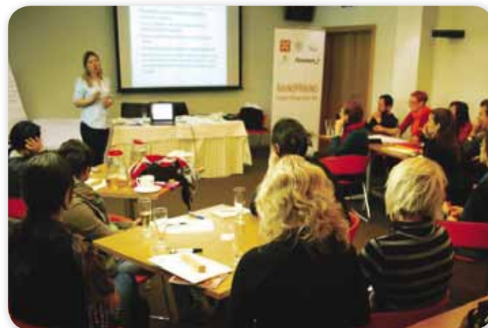
PRINCE, steering committee

ALDA was the partner in the project led by the European House, Hungary with the aim to help raise pu-