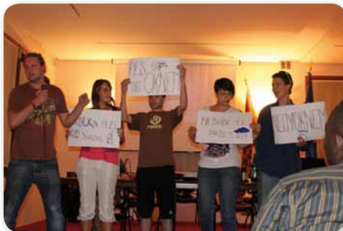
Activities of the project

The project will involve about 400 young people in the 6 countries and will allow them to become aware of the global situation of employment in Europe, stimulating them to imagine new styles and visions for youth entrepreneurship.