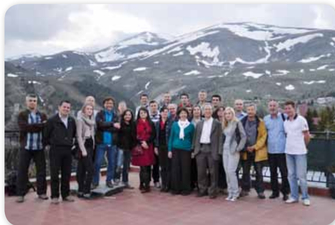
TETOVO seminar on tourism 10-11/05/2012