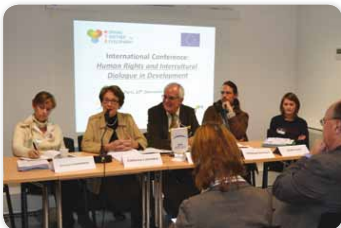
WTD, International Workshop, Human Rights, Paris December 2012

development agents in and outside Europe, in partnership with European and national institutions.