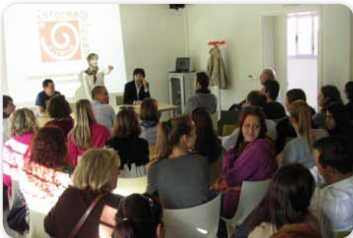
THINK EU, Informa Giovani, Vicenza

3) to familiarise the target groups with available EU programmes and pre-accession funds.