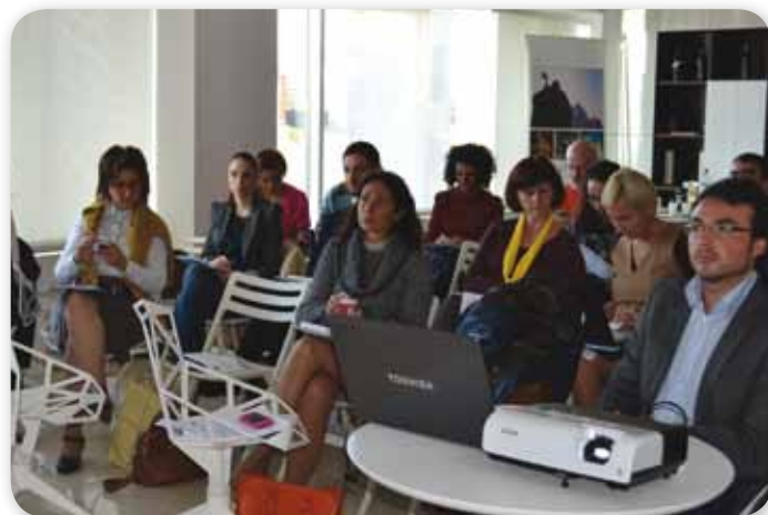
WTD, Training of Trainers, Brussels, October 2012

The project WTD has been widely disseminated through the network of CONCORD (ALDA is member of CONCORD). In particular the project has been disseminated within the EPAN group of CONCORD, focused on the IPA region, the EaP area and the Southern Neighbourhood.