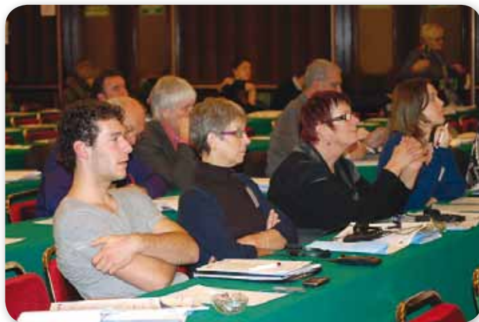
Final event of Stand.Up (Malta, 16-17 January 2012)

Within this Programme, ALDA implemented several projects financed by the Europe for Citizens Programme of the European Commission. Those are STAND.UP that finished at the beginning of 2012, TIC TAC that had its final event in November 2012 and VIT that is still going on in 2013.