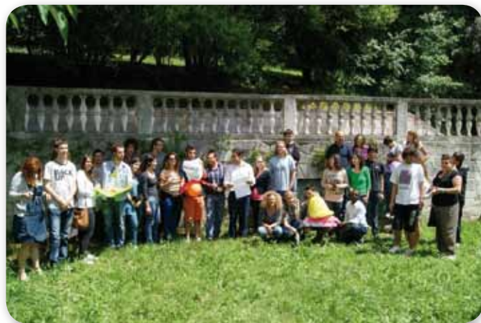
Project new entrepreneurs ways