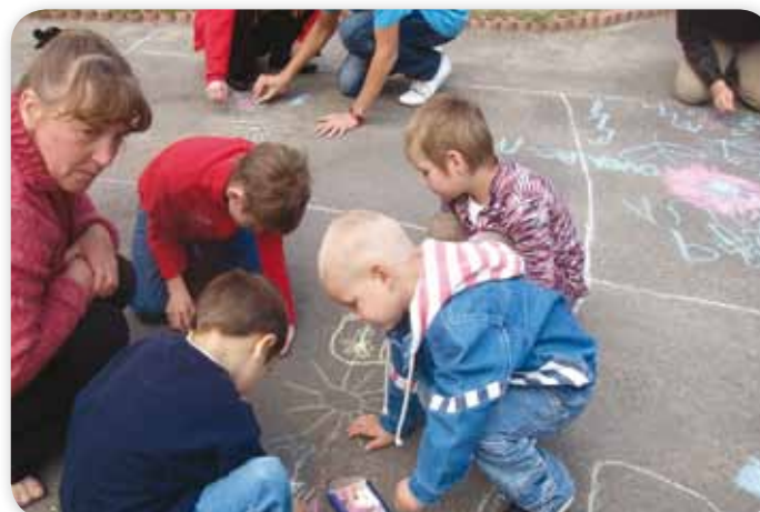
Activities in Belarus

ALDA has been active in Belarus since 2004 and has implemented several projects together with its main partner in Belarus the Lev Sapieha Foundation. The TANDEM project is a follow up to former projects (ACSOBE and REACT) which focused on the strengthening of civil society organisations and local community groups and their cooperation with local authorities. As citizen participation at the local level is still limited in Belarus, TANDEM main objectives were foreseen as undoubtedly significant, providing both technical and