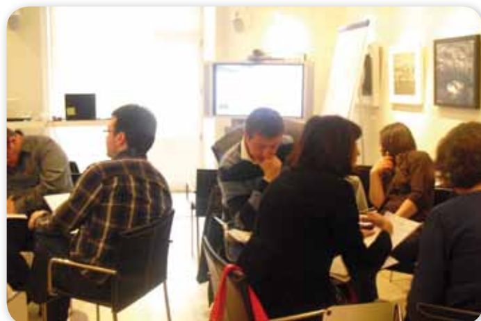
TIC TAC Training session, Brussels, March 2012

TIMING: 6th January 2012 – 15th January 2013