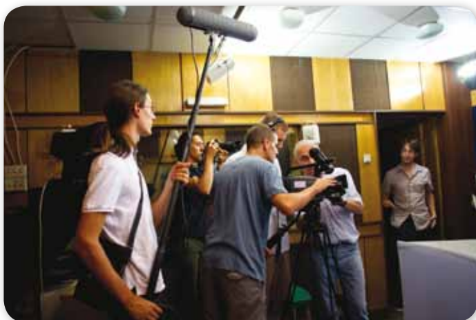
Tour in the Balkans

bloody interethnic conflicts, and are now energetically building their integration to the European Union. Back in their home countries, participants will act as “ambassadors” and transfer their newly acquired experience to fellow students and citizens at the local level. Ultimately, the project also aimed to help these young journalists jumpstart their careers through internships in partner media organisations.