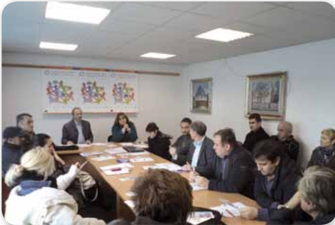
LDA MOSTAR, IPA BiH, Bihac radne grupe