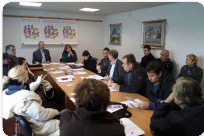
Meeting programme IPA BiH

thematic workshops, trainings, local campaigning for effective implementation of MoU in six municipalities gave an insight into the present challenges of implementing EU standards of democratic governance at local level, the role of local self-governments in EU integration process as well as an overview of local practice in implementing municipal co-operation agreements in Bosnia and Herzegovina. Issue based networking of CSO-s engaged in local democracy development, youth and women's empowerment and environment protection resulted in creation of the informal regional network promoting good governance and active citizenship in Bosnia and Herzegovina. Further to this, information campaigns were organized in support to better co-operation between local authorities and CSO-s, local CSO address books were printed and disseminated while the Handbook on best practices promoting cross-sectoral partnerships will be published and widely disseminated.