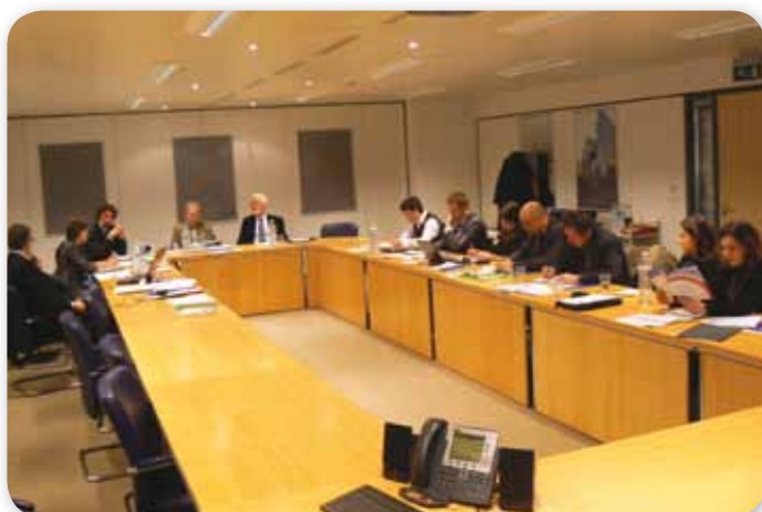
Steering Committee, Brussels