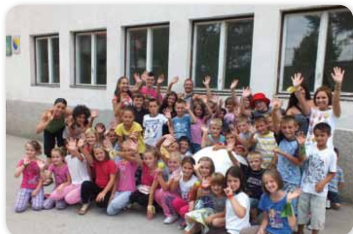
LDA ZAVIDOVIĆI, activities with schools

Association Donne – Donne in nero Progetto, Italy