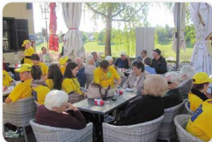
LDA SISAK voluntary work camp in Sisak volunteers and citizens having a coffee