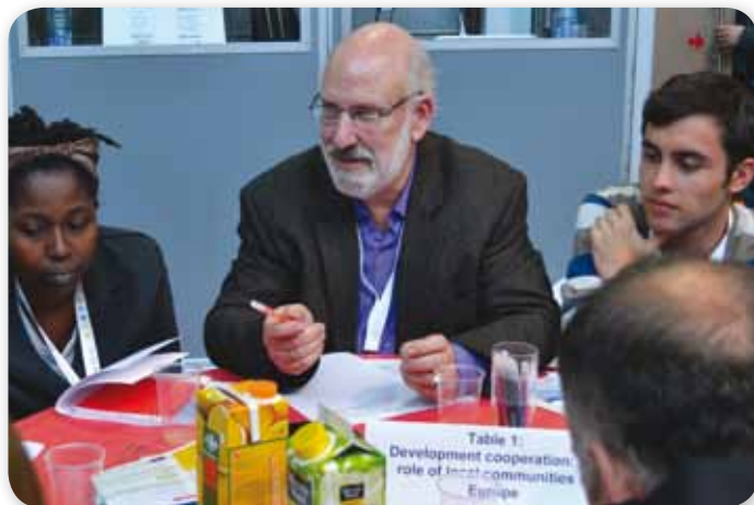
WTD, European Development Days, Brussels October 2012

nised to exchange experience and provide the participants with further expertise on these issues.