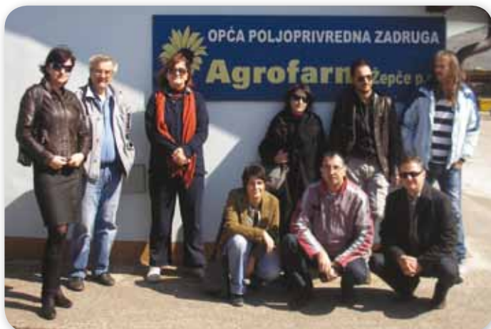
IPA 2011, Zavidovici

The project was implemented in close collaboration with LDA Zavidovici and was intended to help provide clear and factual information on EU enlargement and pre-accession assistance to the citizens in local communities in Bosnia and Herzegovina – Zavidovici, Zepce, Zenica. The project activities were designed to support common understanding of reform process, but also help improve the visibility of specific pre-accession assistance. Further to this, through engaging diverse sections of local society, the action helped raise awareness of what the integration would really mean for BH, while the debates involving local stakeholders will make the prospect of enlargement more credible. Over the last year two training seminars were held for