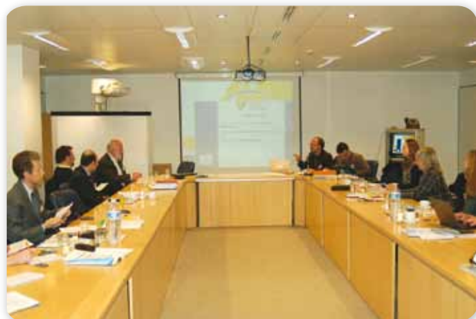
WTD, Steering committee, Brussels

Working Together for Development (WTD) - Non-state actors and local authorities in development – European Commission