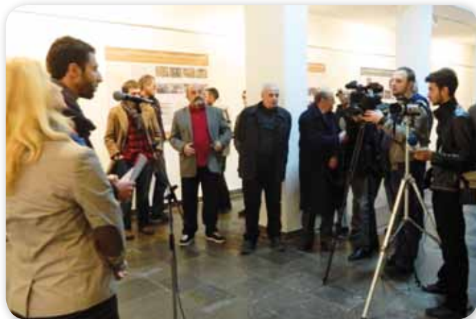
LDA KOSOVO Exhibition in Peja

The important part of the project was mobilisation of all actors on the phenomena of school dropout, this is not anymore a hidden phenomena but open is talked about it and the interest of all representatives of NGOs of Peja/Pec is high in making pressure to the Directorate of Education to face more with this phenomena and through the last phases of the project there is a big hope that will be produced a good and practice Action Plane to deal with the phenomena of school dropout in Municipality of Peja/Pec.