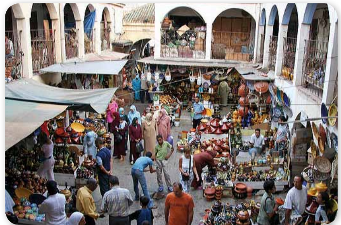
Market, Safi, MAROCCO

The launching conference in April gathered around 60 young people, representatives of youth organisations and local authorities, researchers, experts coming from 14 Euro-Mediterranean countries. Eighteen months after the first events of the “Arab Spring”, this conference allowed an open space for discussions and exchange of good practices between people from different Arab countries and from both sides of the Mediterranean.