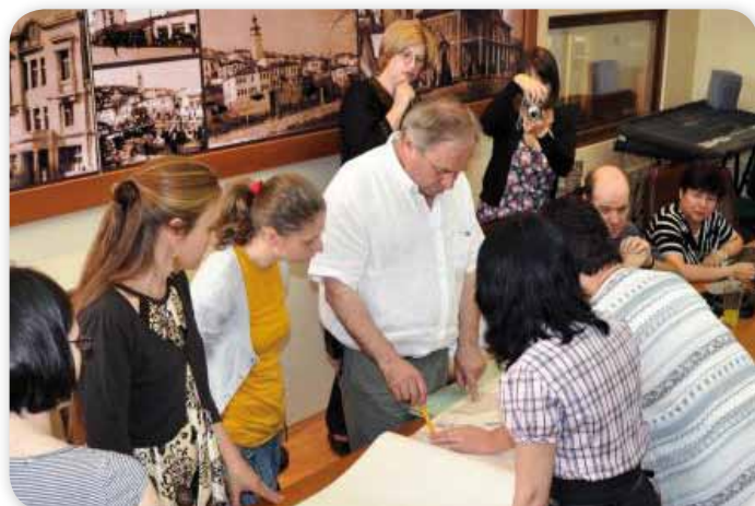
Activities in Macedonia

The local government is facing a numerous issues: