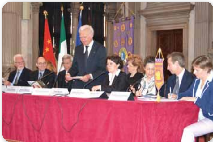
LIONS Club, Venice, 28 April 2012

ALDA cooperated with the Lions International Venezia Host for the organization of an international conference, held in Venice on the 28th of April, focused on good governance and active citizenship. Different institutions and organizations (Council of Europe, local authorities, NGOs, etc.) took active part in the event and the debate, as well as in the related event inaugurating the first “active citizenship park” in Venice.