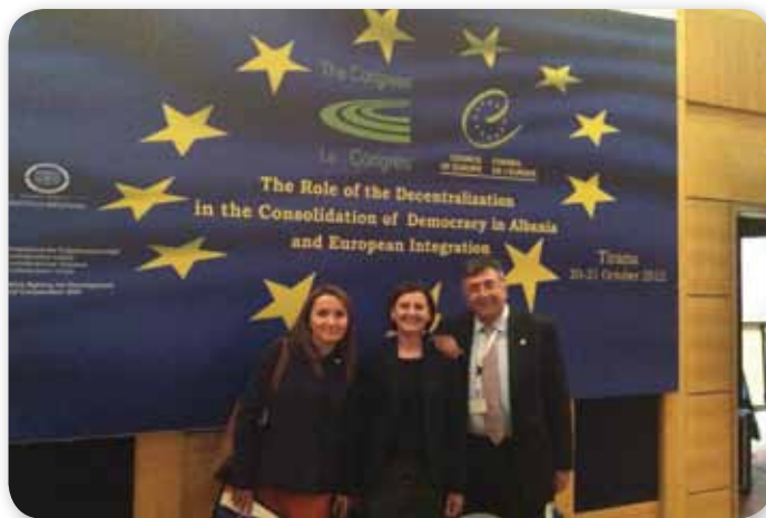
LDA ALBANIA, Tirana October 2012