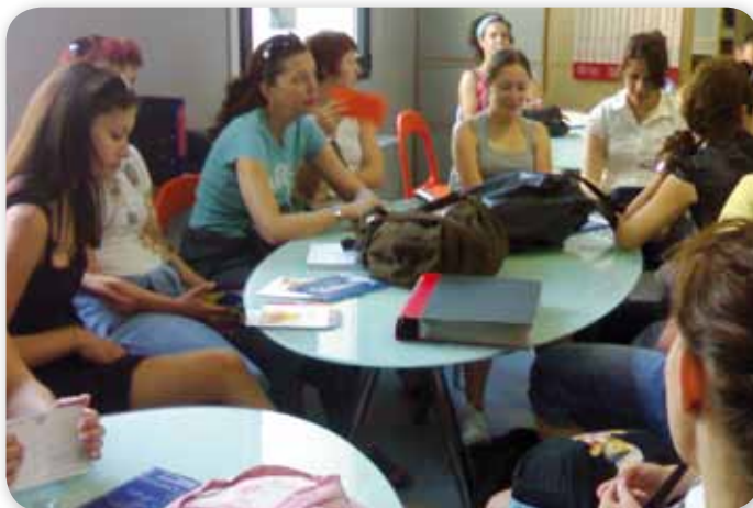
THINK EU, activities in Istria

The project had a great impact on the youngest participants in kindergartners, here is a testimony by one of the Croatian teachers "It (the project) was a trial version and we got so good results...we didn't know how much the kids already know and how much they are affected by their parents, medias and family members. They produced really impressive materials, games, etc...for better knowledge about other countries. In several cases, their ideas did not come for teachers, but from the kids themselves."