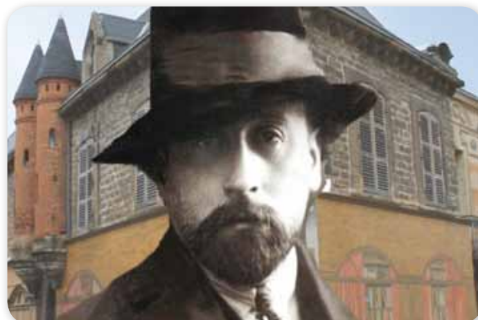
Sur Les Pas d'Albert Londres