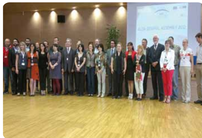
ALDA, LDAs Team and new Governing Board