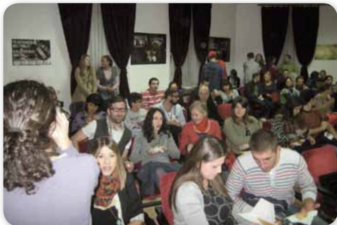
LDA CSS, Citizenship + Open workshop in Nis

Good cooperation between public institutions (schools, library etc.) and local CSO were established. All CSOs supported by Tavolo con Balcani took active participation and gave valuable contribution to different local, national and regional professional networks. All activities in 2012 attracted a large number of volunteers who gave their contribution to the success of all the aforementioned programmes. We consider all this as our success stories in 2012. Finally, we think that the fact that our work is well embedded in local community is of huge importance. This deep connection with territory we work on certainly amplified results achieved in 2012.