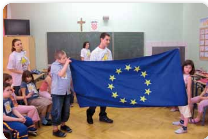
LDA OSIJEK, activities with schools

Opening conferences and the Training on Town Twinning gathered 12 municipalities and towns from Croatia and Serbia interested to develop mutual cooperation and projects in the future.