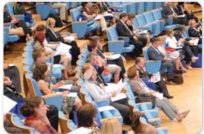
ALDA General Assembly 2012, 150 participants

For many years, European institutions, local authorities and civil society have been active supporting democracy and good governance in Eastern Europe and in Western Balkans. The European Union decided a further enlargement towards South Eastern Europe and developed new forms of cooperation with Eastern partners. How this experience could be of benefit of southern countries, which are living a new and difficult spring? How to do it and bring an added value? Is it appropriate to do it? Which methodology to adopt in this case? These questions and many more have been discussed during the conference splitted in two panels focusing on the “opportunities for consolidating the European Policy and Action in Neighbouring Countries” and “Networks of Civil Society active for Local Governance. Lesson learned and ideas for the near future”. ALDA members had the chance to debate and listen to relevant panellist from Eastern Europe and Mediterranean countries.