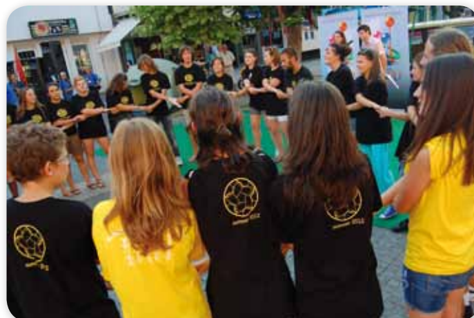
LDA PRIJEDOR Youth fair 2012