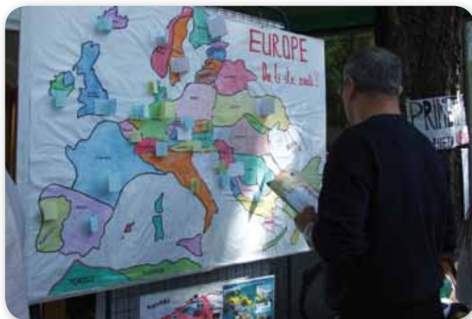
LDA SUBOTICA Day of Europe - EU Info Point

Establishing new contacts between local authorities in Croatia and Serbia, with the possibility of creating a joint project proposal in the framework of the Europe for Citizens Programme. Opening of Resource centres in Subotica and Osijek for networking and town twinning.