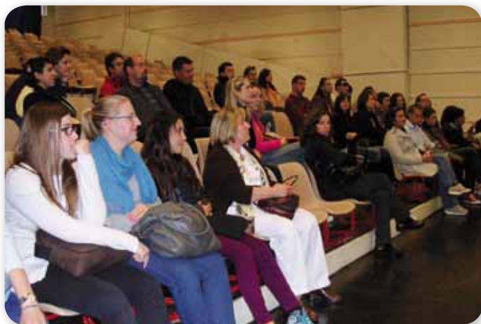
THINK EU, visit in Vicenza