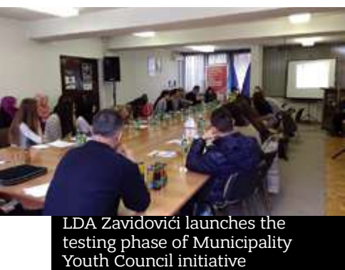
LDA Zavidovići launches the testing phase of Municipality Youth Council initiative