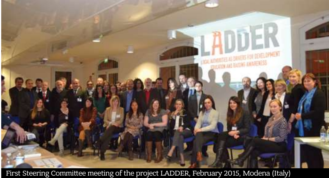
First Steering Committee meeting of the project LADDER, February 2015, Modena (Italy)