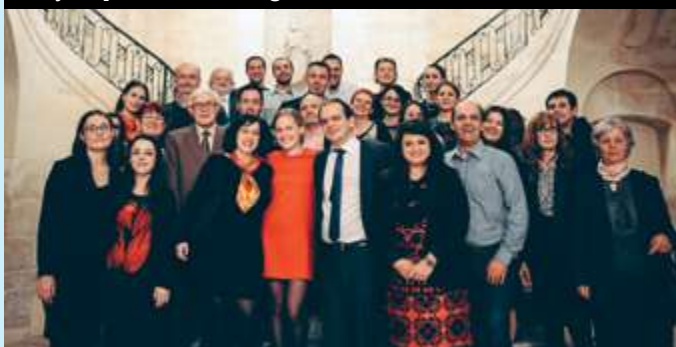
Cooperation Lower Normandy - Macedonia: Project partner meeting in Caen (France), October 2014

The decentralised cooperation programme supporting the Lower-Normandy Regional Council in its activities in Macedonia has been confirmed and further developed, with a brand new website and call for projects. The France-Balkans programme for good governance and territorial development has also been continued by the leader partner, our member, Pays Vichy Auvergne thanks to the support by the French Ministry of Foreign Affairs. In the region, we also developed activities within the programme Europe for Citizens. The project LADDER will also involve partners and associates in SEE, and one of its geographic path will be focused on the area.