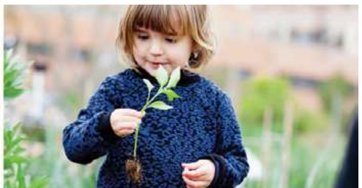
COHEIRS – Civic Observers for Health and Environment: Initiative for Responsibility and Sustainability, activity in Spain