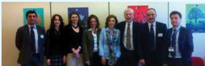
Meeting with ALDA's Azeri members at the Council of Europe

The project aims at empowering Azeri youth, fostering their skills, knowledge, and employability. Run in cooperation with BINA, it addresses the high problem of unemployment of local youngsters.