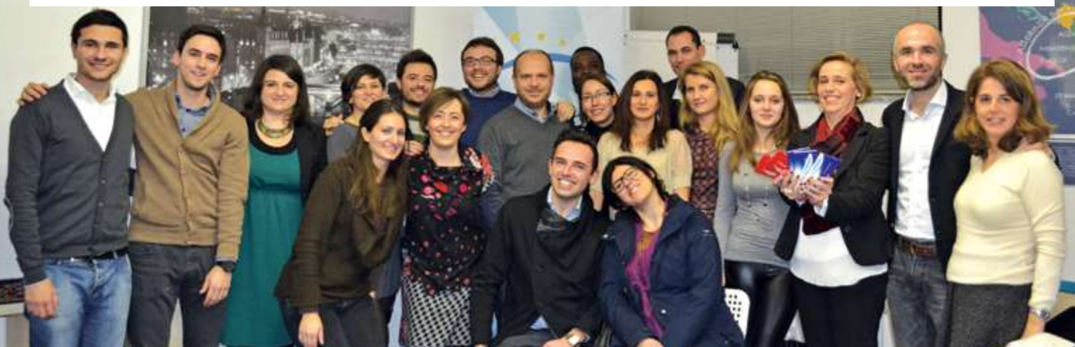
The team of ALDA - present and past staff members, January 2015, Vicenza - Italy