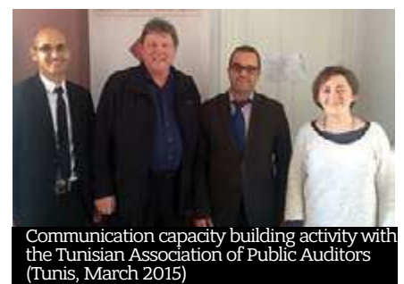
Communication capacity building activity with the Tunisian Association of Public Auditors (Tunis, March 2015)