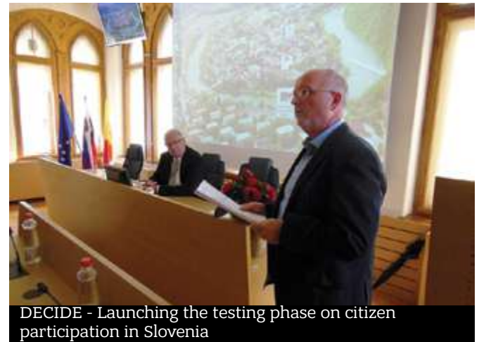
DECIDE - Launching the testing phase on citizen participation in Slovenia

Through the establishment of a thematic network of towns and by adopting a bottom-up approach, the 24 partners from 14 countries [4 countries of the “old” EU15, 6 countries accessing the EU between