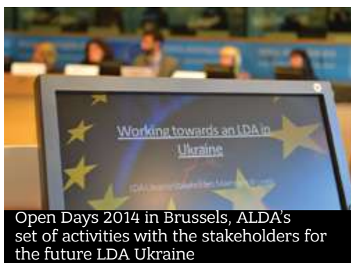
Open Days 2014 in Brussels, ALDA's set of activities with the stakeholders for the future LDA Ukraine