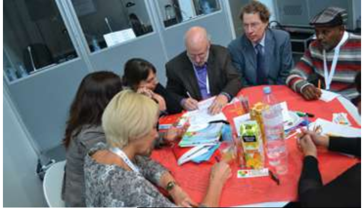
Working Together for Development and ALDA at the European Development Days