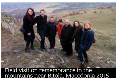
Field visit on remembrance in the mountains near Bitola, Macedonia 2015