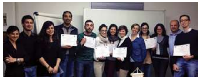
Diploma award ceremony - ALDA's office in Vicenza, Italy