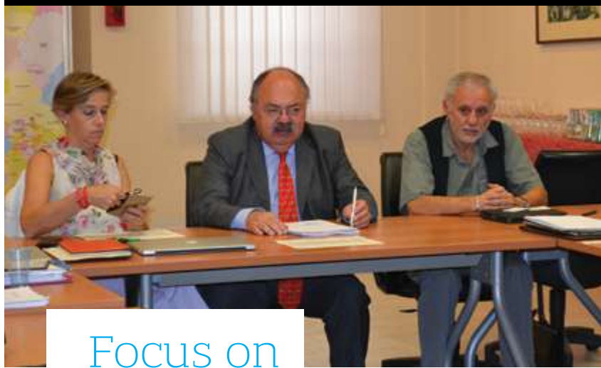
ALDA EuroMed working group meeting in Trieste (Italy), September 2013