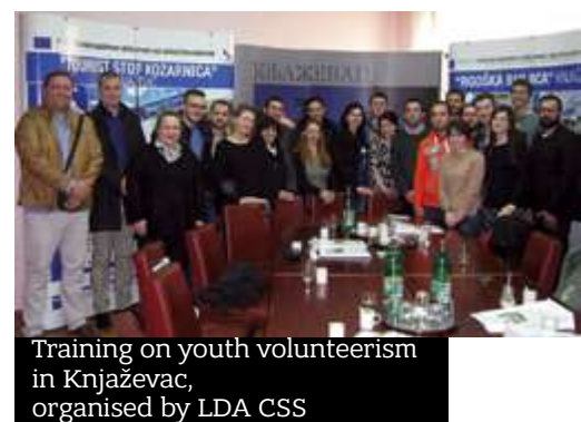
Training on youth volunteerism in Knjaževac, organised by LDA CSS