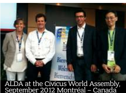
ALDA at the Civicus World Assembly, September 2012 Montréal – Canada

Projects such as "LEADERS - Local Environments: Active development of environmentally responsible societies" involving partners from all over the world also contributed to our worldwide activities. The project, led by our member association Studio Progetto and co-funded by the EU programme Youth in Action, aimed at developing a global partnership of organizations working with young people interested in environmentally friendly societies and capable to act locally to enable a better environment and life for all.