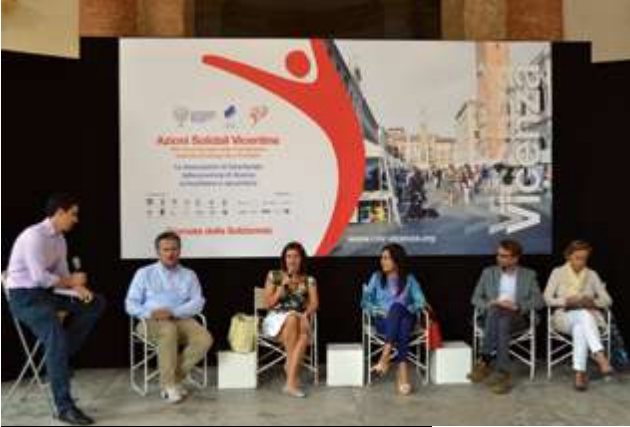
ALDA at the day promoting volunteerism in Vicenza, Italy