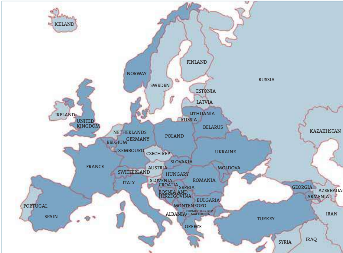
ALDA's member and partner network

The Association of the Local Democracy Agencies (ALDA), initiator and lead partner of the project “EURaction – Citizens acting for Europe”, was founded in 1999 with the help of the Council of Europe’s Congress of Local and Regional Authorities to co-ordinate a network of Local Democracy Agencies (LDAs) in South East Europe and the Southern Caucasus already in existence since 1993. The main aim of ALDA and the current 11 LDAs is to foster human rights, local democracy and sustainable development – not only in the regions where the LDAs are located, but also across Europe. To achieve this goal, both ALDA and the LDAs are co-operating with a network of more than 300 members and partners from 28 European countries.